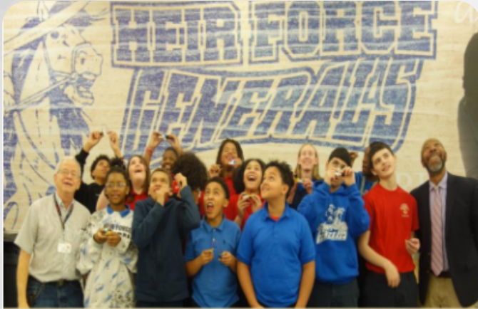
Is that an alien spaceship responding to our LEDs?

Heir Force Community School hosted an engaging STEM Hands-On Workshop, offering students an immersive experience in constructing an electronic circuit to illuminate an LED light. Emphasizing the crucial safety practice of "Power off during building," scholars were introduced to fundamental concepts, laying the groundwork for future understanding, such as the principle of "Lock Out, Tag Out," albeit in an age-appropriate manner. Delving deeper, students explored the visual and functional aspects of various electronic components, alongside mastering the utilization of a solderless breadboard for circuit assembly. A heartfelt appreciation is extended to Procter & Gamble for their generous financial contribution, enabling Heir Force Community School to realize this educational endeavor. Such initiatives serve as a gateway, broadening students' horizons and exposing them to potential pathways they might not have previously considered.